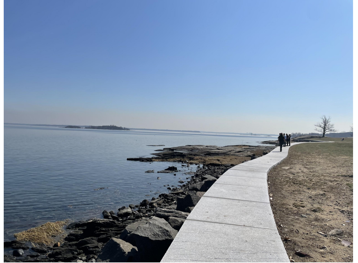
Davenport Park, New Rochelle