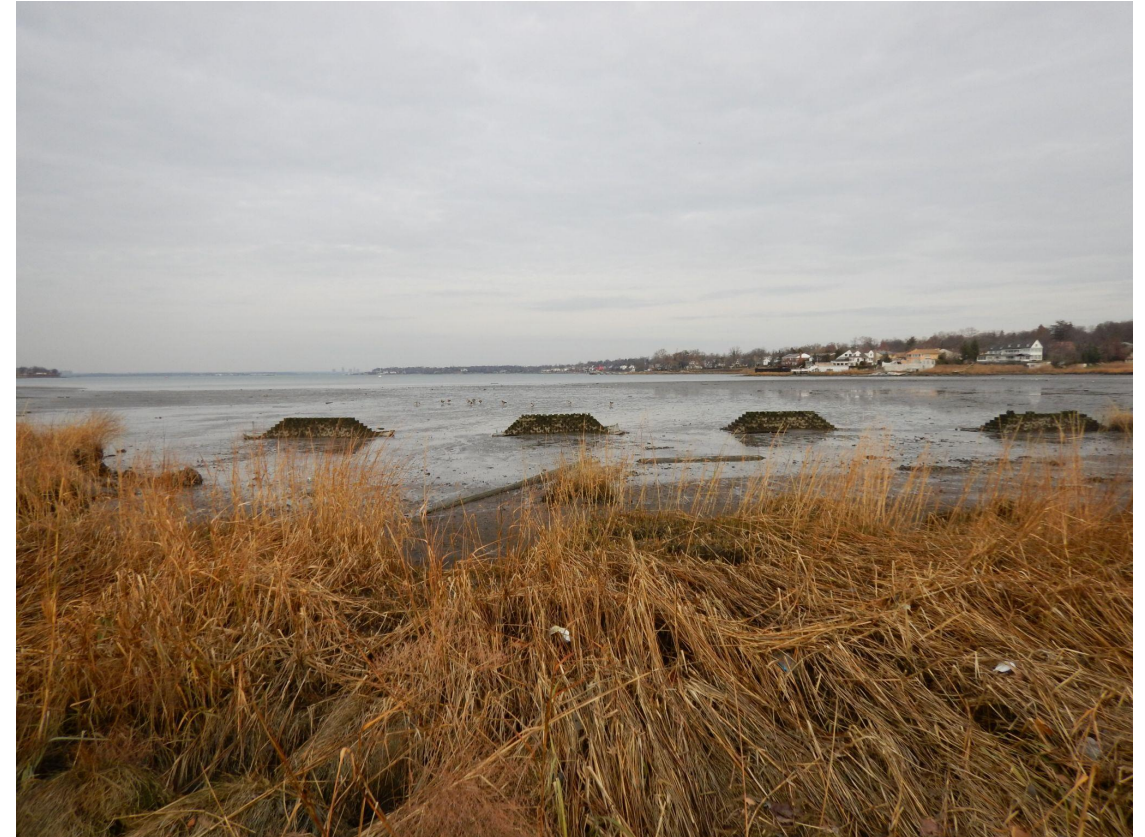
Oyster castles that are part of a LISS Futures Fund NYC Parks tidal wetlands restoration project at Alley Pond Park, Douglaston/Queens, NY.

More info: https://www.nfwf.org/programs/long-island-sound-futures-fund