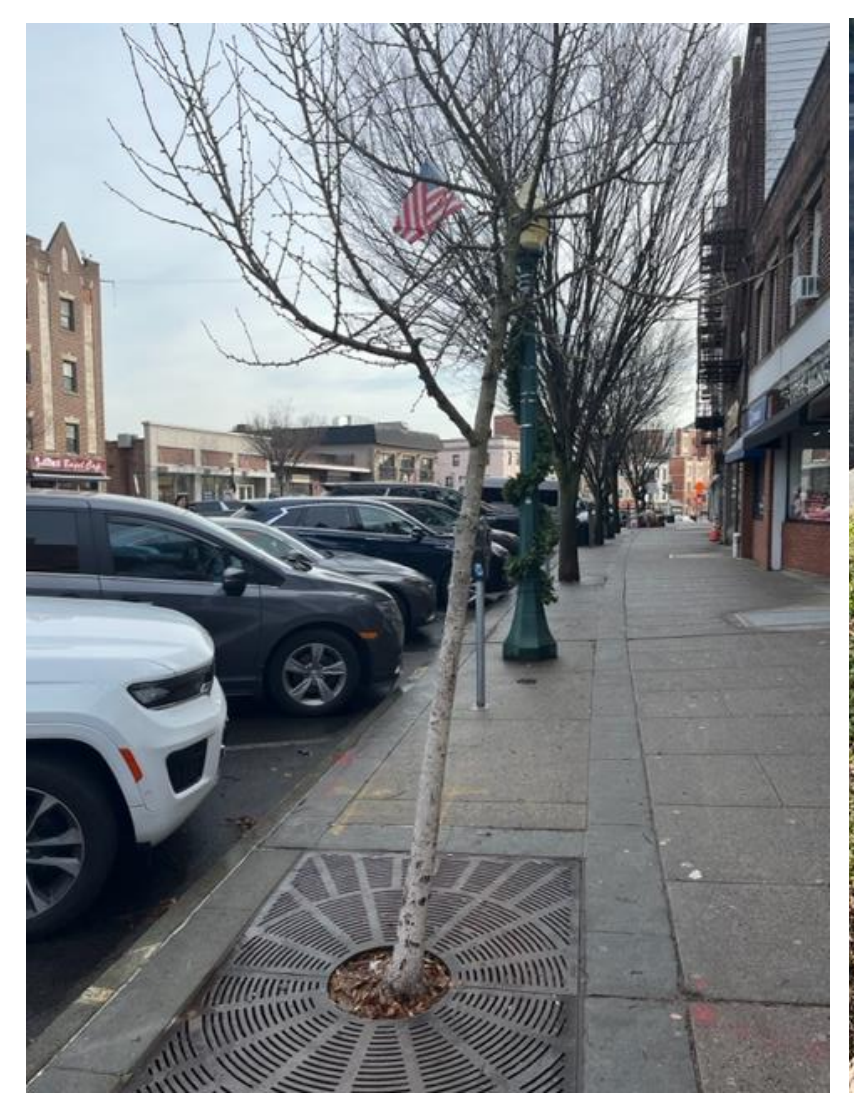
Mt. Pleasant Ave. @ Prospect