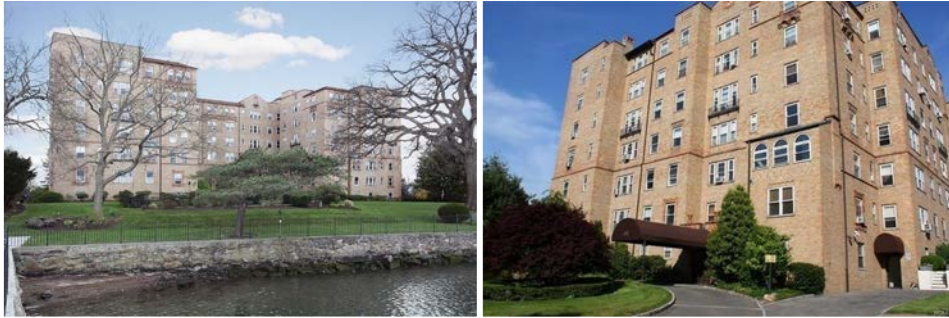
View of 490 Bleeker Avenue from the water (left) and Bleeker Avenue (right)

The Applicant submits that, in contrast to these other medium to high density developments, Alternative G, the condominium development, has been specifically designed to minimize visual impacts to adjacent properties and public viewsheds. Alternative G would modify and add to the existing clubhouse, but would only marginally modify the proposed height from the height of the existing building. The proposed building would be well-integrated with the existing clubhouse, and given the topography of the Project Site, would hide much of the bulk of the proposed building in the hillside adjacent to the clubhouse. Exhibit 4-10c from the DEIS is copied below to show a view of the proposed building. The building would also be enhanced by proposed landscaping. Exhibit 4-11 of the DEIS provides cross section views from some of the closest residences off-site to the clubhouse and proposed residential building. The site sections show that existing views to the Project Site would not be materially modified by the development under Alternative G. In addition, under Alternative G, the entire members only golf course would remain intact, preserving 101.8 acres of recreational open space in perpetuity (through a conservation easement, or other legally binding mechanism) and maintaining it as an existing element of the Orienta community's character.