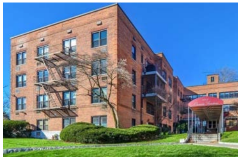
Fairway Green Townhouses (left) and Orienta Gardens (right)

Source: Fairwaygreen.org; Ginnet Real Estate