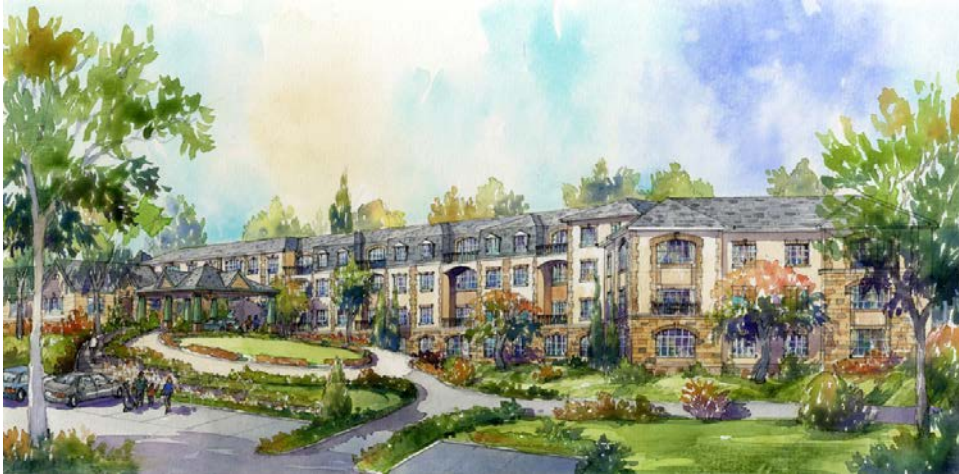
Exhibit 4-10c of the DEIS: Alternative G View from Cove Road

Visual evaluations from Delancey Cove for the Alternative G found in Appendix C Figures present the full build (Four Stories) and reduced three and two story versions as photo simulations inserted into a winter landscape (no leaves). The full four-story Alternative G is comparable with the magnitude of adjacent structures and is buffered by the existing tree line which extends well above the roof. The reduced story alternatives step below other structures in the viewshed and are further hidden by existing trees.